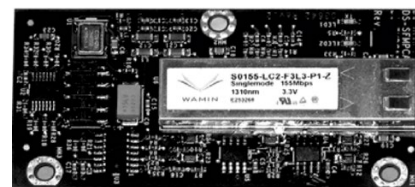
SK-FSL (SINGLE MODE FIBER)

4 x 40 display and four programmable function buttons designed to help automate tasks and reduce time spent at the panel.